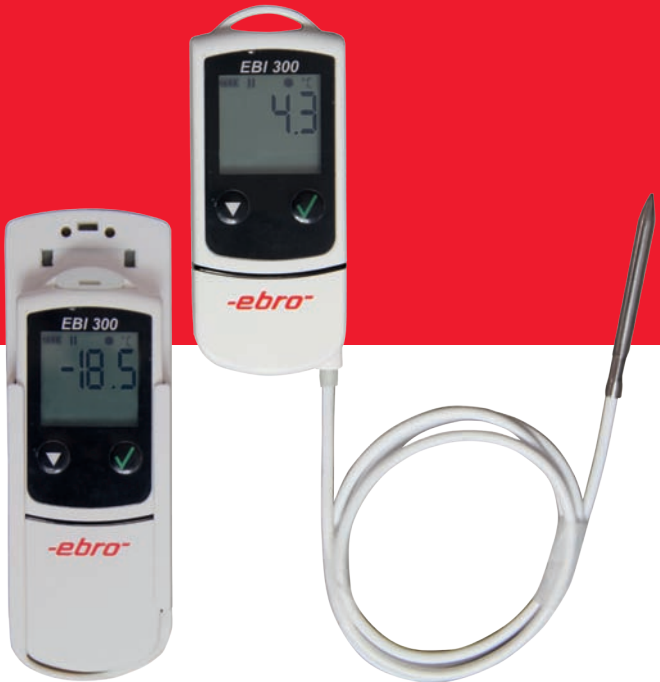
EBI 300 shown here with optional wall mount